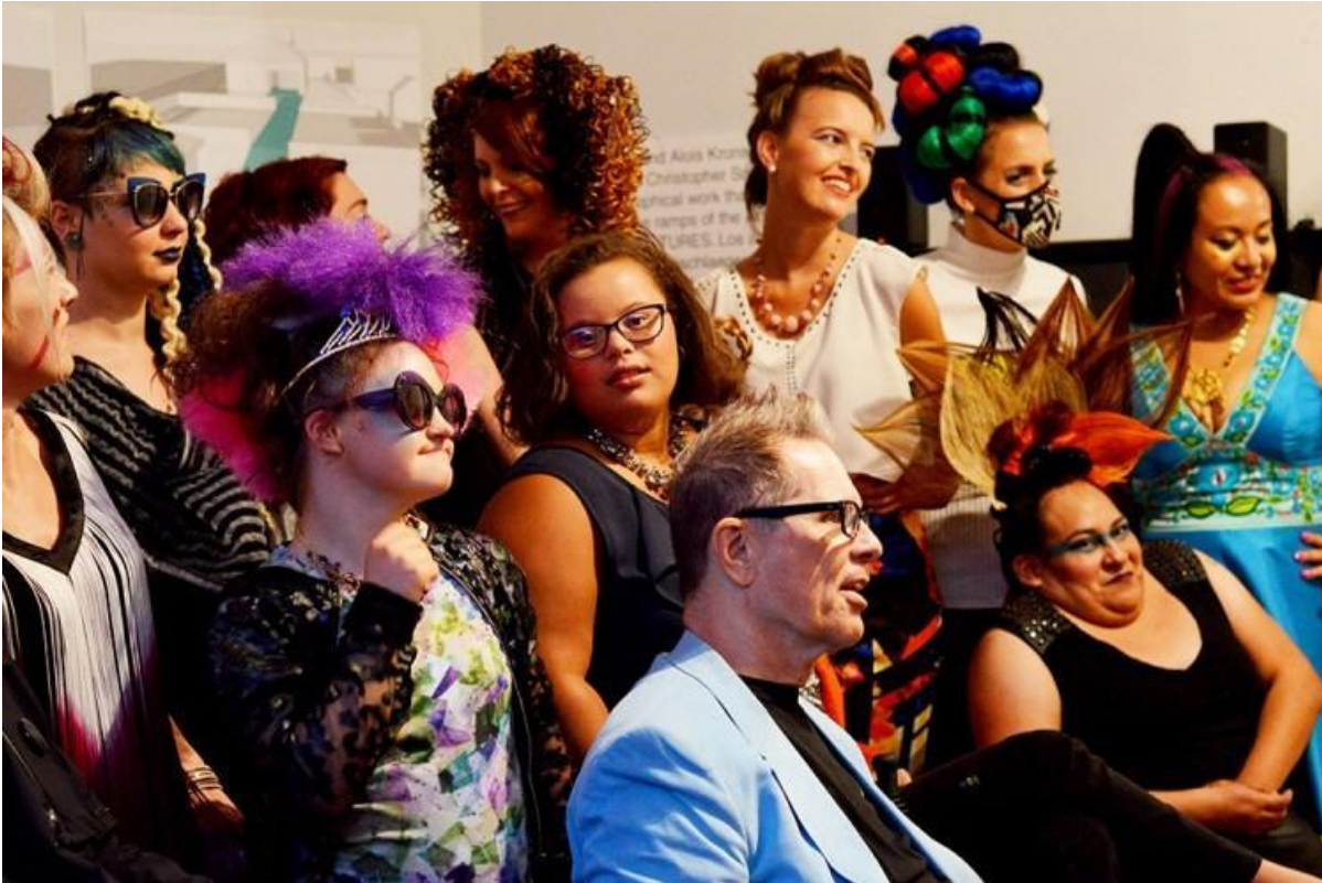
Figure 2. Disabled Models at ELEVATE: A DisArt Fashion Show courtesy of Artprize, 2016.

The symposium concluded with a seminar on accessible event planning offered to professionals who wanted to learn more about designing public events that were functional, welcoming, and accessible. “Our community partners want to learn how to plan events and look at spaces differently,” said Smit. “They want to do better, but they do not know how to go about it.” Moving forward, DisArt hopes to expand their consultative services and provide resources for the professional development of disabled artists. Their consultations currently include providing education about the culture of disability, accessible event planning, and internal and external communication to assist outside organizations in becoming confident in approaching audiences of all abilities. Artist development will fall in line with direct service provisions, sponsorships, and scholarships. “We want to support our clients as artists and individuals,” said Vyn.